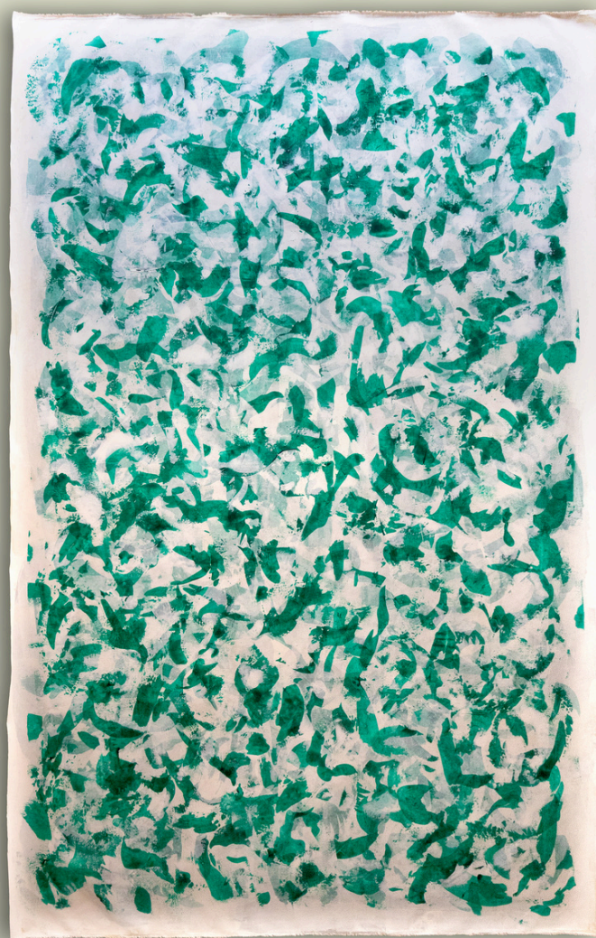
Eternal Seasons Collection, 2024 147 cm x 213 cm (58 inches x 84 inches) Acrylic on Canvas